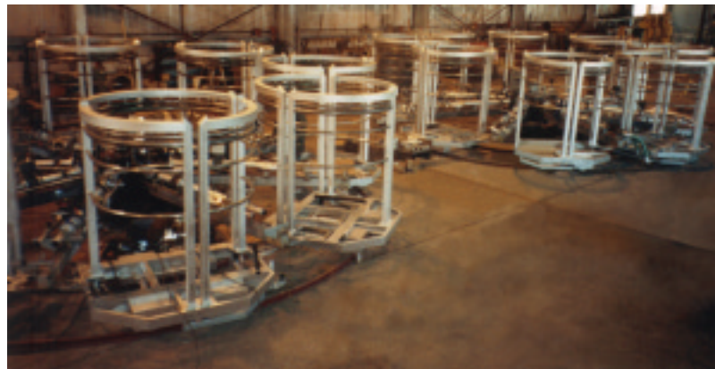
Carousel type, cooling mold handling system for fused oxides, fully automated control