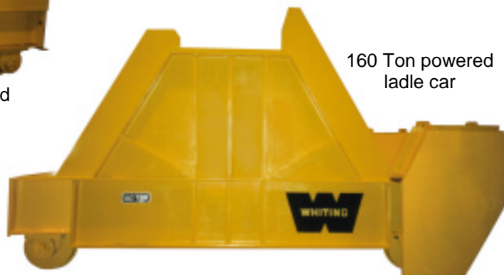
160 Ton powered ladle car