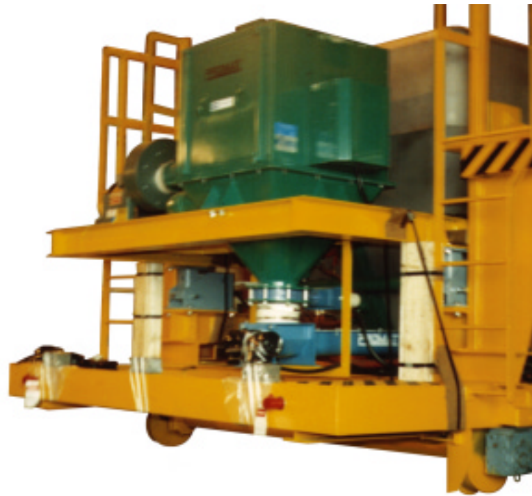
Custom built "weigh scale transfer car" for the completely automated mixing and delivery of steel mill fluxing and molding powers – ready for shipment