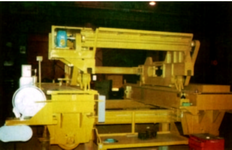
85 Ton capacity, bottom tapping ladle ingot pouring transfer car with transversing carriage arrangement