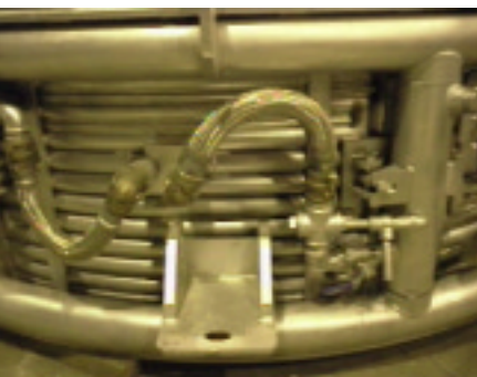
Water cooled ladle furnace roof