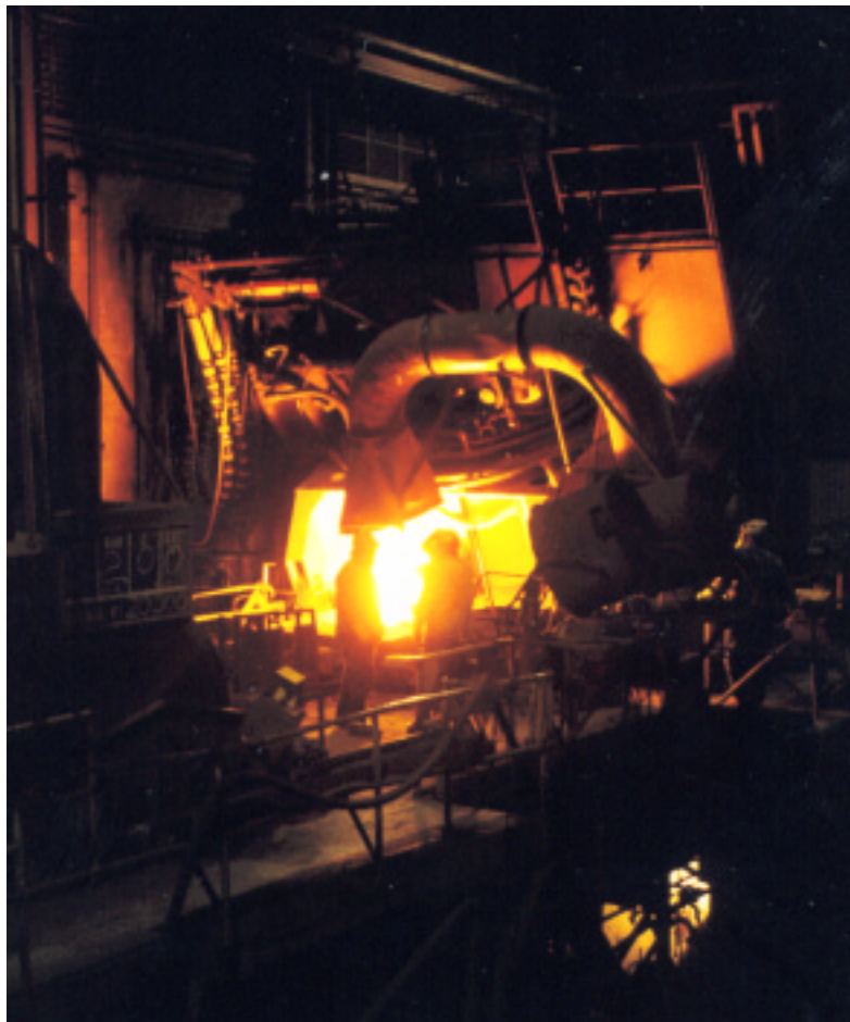
15 Ton foundry furnace