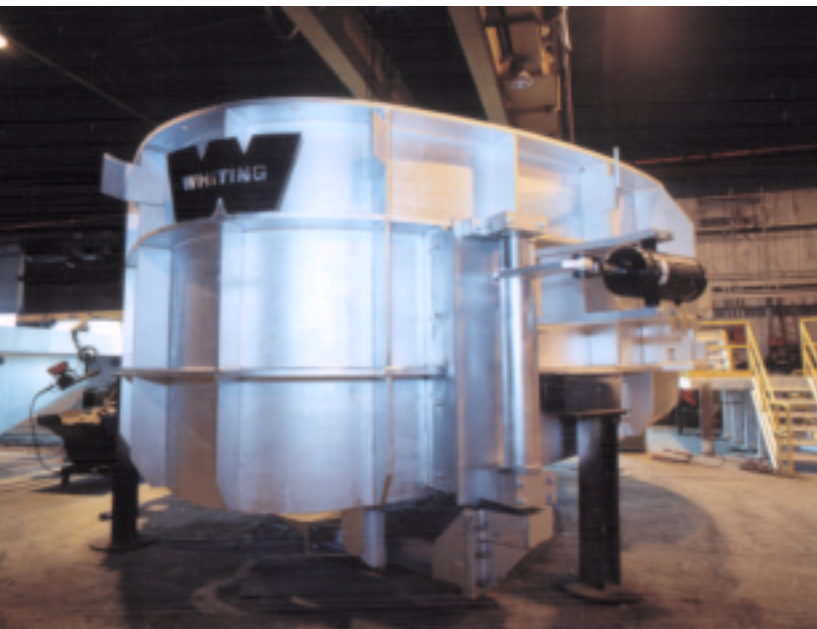
135 Ton eccentric bottom tap hearth for steel producing EAF

Engineering and manufacturing services have been extended to also include equipment for the mineral fusion industries and for other special application needs.