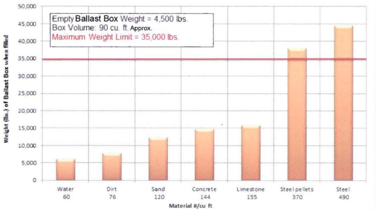
Ballast Box fill material

This Ballast Box is capable of holding scrap materials, which can often be found in or around an industrial facility. This translates into saving you money and putting these scraps to work, helping you move more railcars.