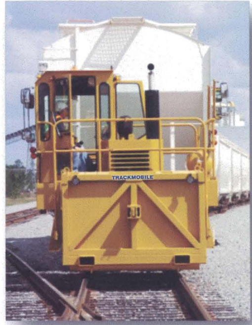
Tractive Effort Single coupled load with Ballast Box

This accessory provides a similar tractive effort to double coupling, without the obstruction of view.