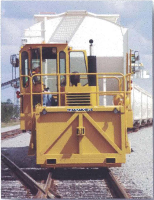
Tractive Effort Single coupled load with Ballast Box

This accessory provides a similar tractive effort to double coupling, without the obstruction of view.